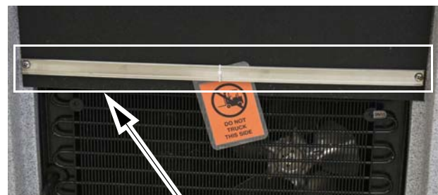
Cover brace Figure 2: Location of cover brace